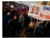
Putin's majority to make Russia's 2018 presidential election a referendum

Contrary to forecasts, the complicated economic and foreign policy situation has not reduced the number of those who support President Putin. Experts of the Civil Society Development Fund said in the report titled "Putin's Majority: On the Eve of Large Election Cycle" that the number of Putin's