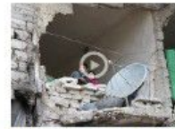
US decides whom to give Raqqa