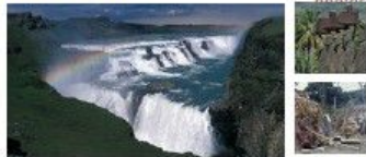
Pristine beauty of Iceland