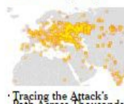
Tracing the Attack's