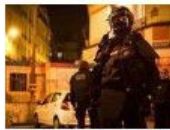
French prisons: Secluded camps to hire and train new ISIL fighters

One of the prime goals for new President of France Emmanuel Macron is to completely eradicate terrorism in the country. The killing of a policeman on the Champs-Elysees shortly before the first round of the presidential election has once again reminded the French: the level of the terrorist threat in