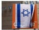
Should Israel be home only to Jewish people?

The parliament of Israel has given a preliminary reading to the draft law on the Jewish character of the State of Israel. As many as 48 MPs voted for the bill, 41 voted against it. The bill gives special legal privilege only for the Jewish majority at the expense of the right and the status of the Arabian minority of Israel