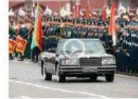
Victory Parade 2017: Memory lives on